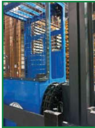
MESH FRONT & REAR