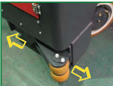
ADJUSTABLE GUIDE ROLLERS