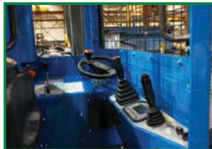
SPACIOUS ERGONOMIC CABIN