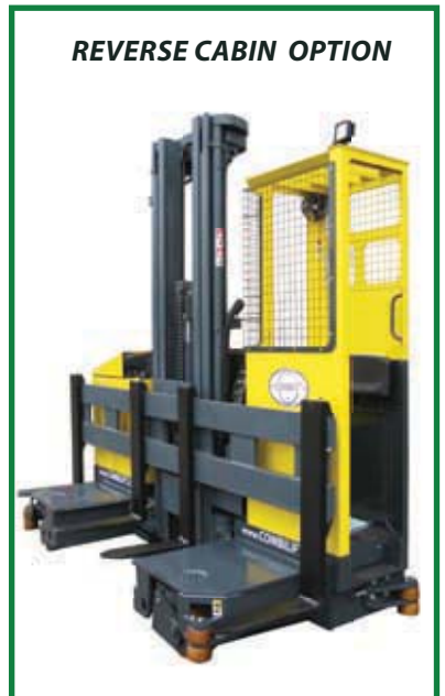
REVERSE CABIN OPTION